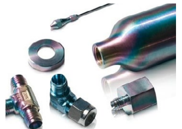
SilcoNert® coatings can be requested on all/any components.