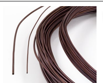
1/8" and 1/6" OD tubing with SilcoNert® 2000 coating.