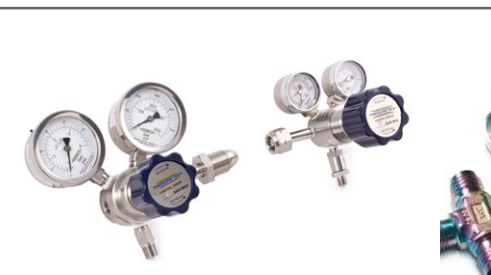
Typical size regulator vs the Micro300

The MICRO300 features fully supported 'sensitive' pistons and a low internal volume to reduce wasted gas and minimise reactions. The regulator is available with or without SilcoNert® 2000 coating.